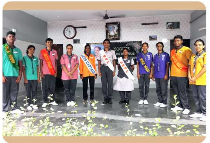
School Toppers Award 2024-25 Presented by Principal